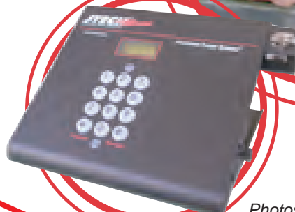
Robust Transmitter with user friendly functions